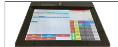
Touch panel display